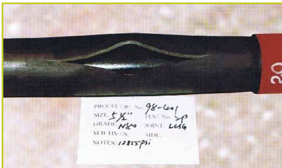
Petroleum Casing Blow Test