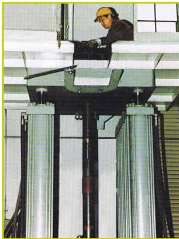
Petroleum Casing Tensile Test